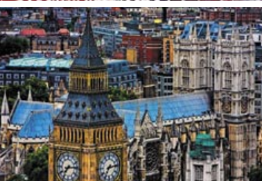
Big Ben & Westminster Abbey

Participants may receive either EN or FR credit.