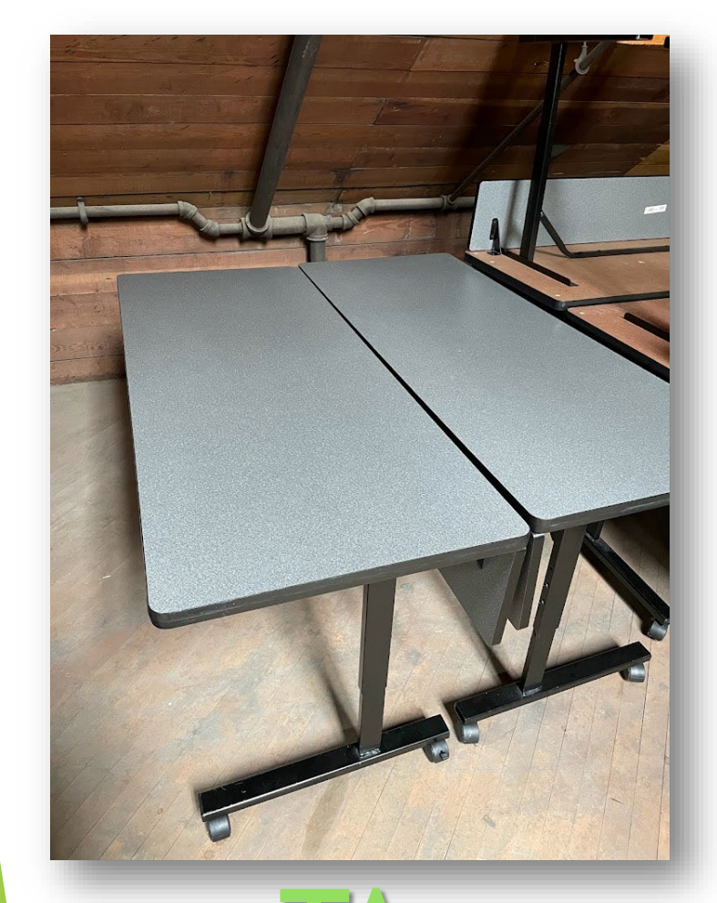
TA Qty. 30