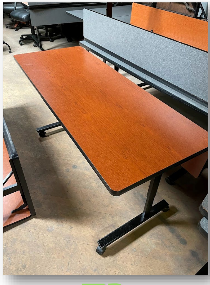
TB Qty. 16