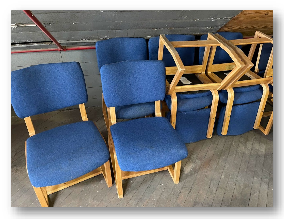
U - Qty. 9