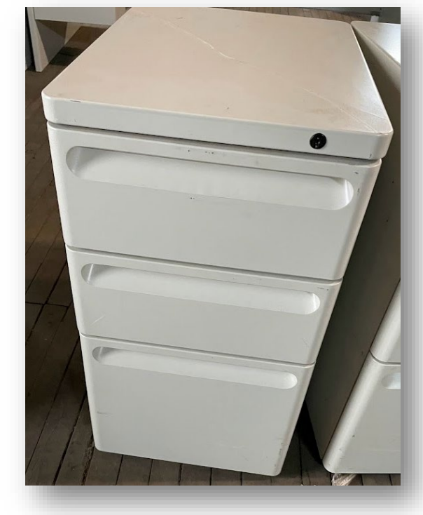
Short Sturdy 3 Drawer Qty 6