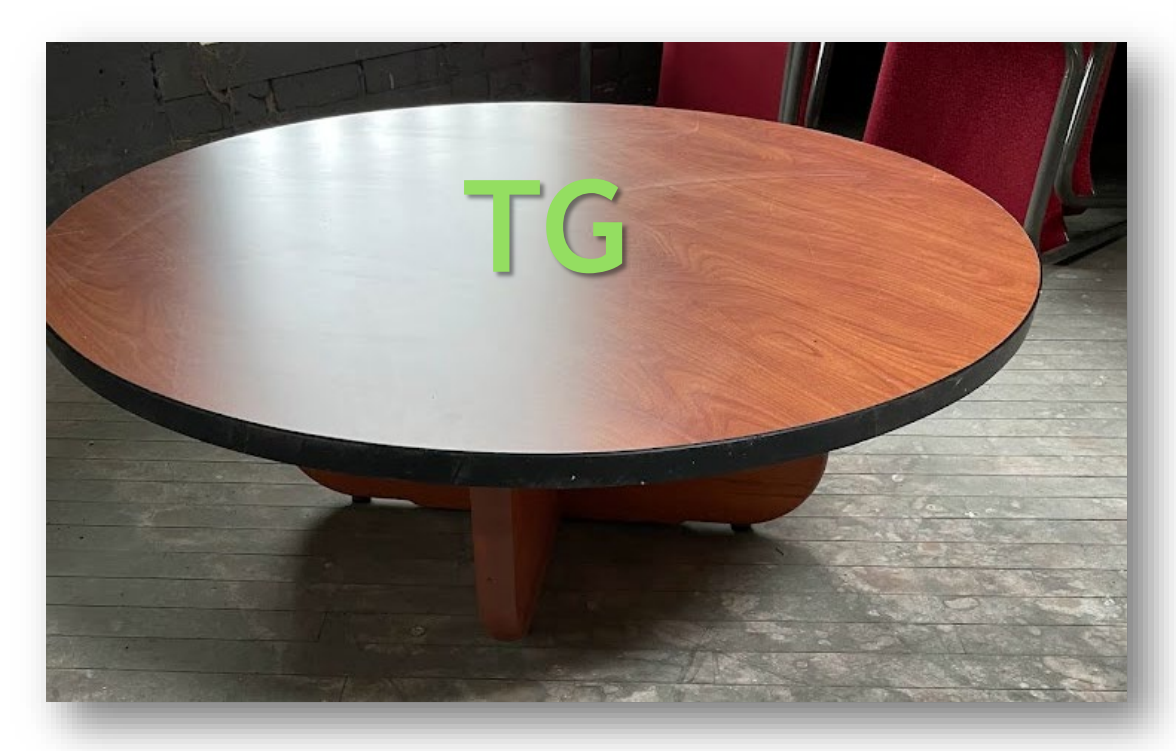
4' Coffee Table