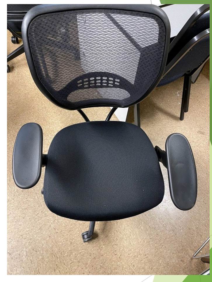
XA Qty 20