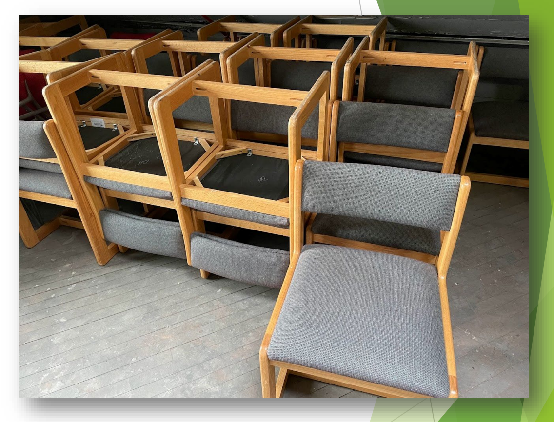
V - Qty. 32