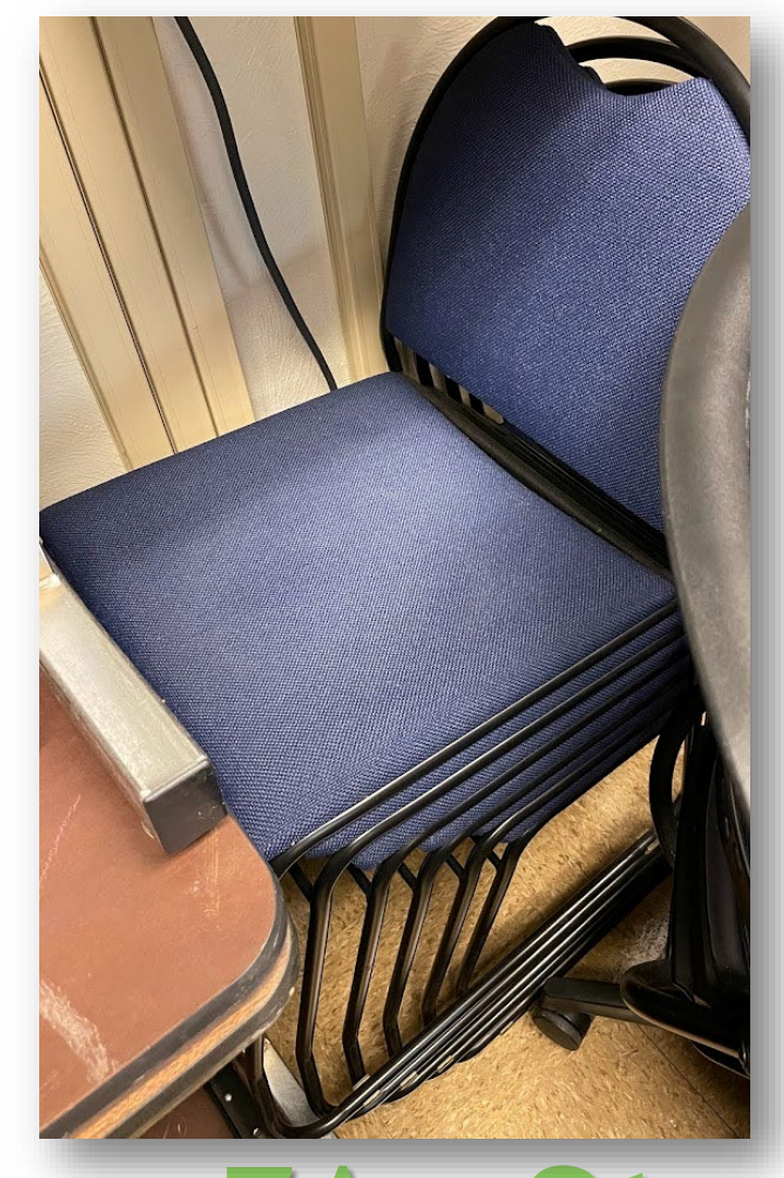
ZA - Qty. 6