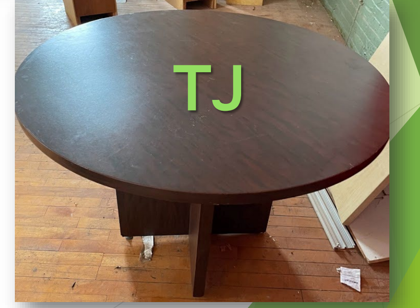
4' Office Table