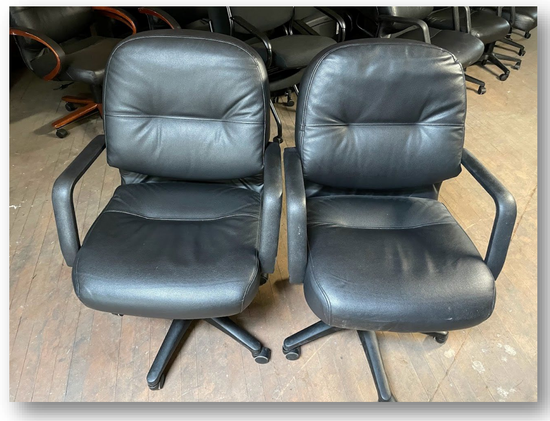
X Qty 23