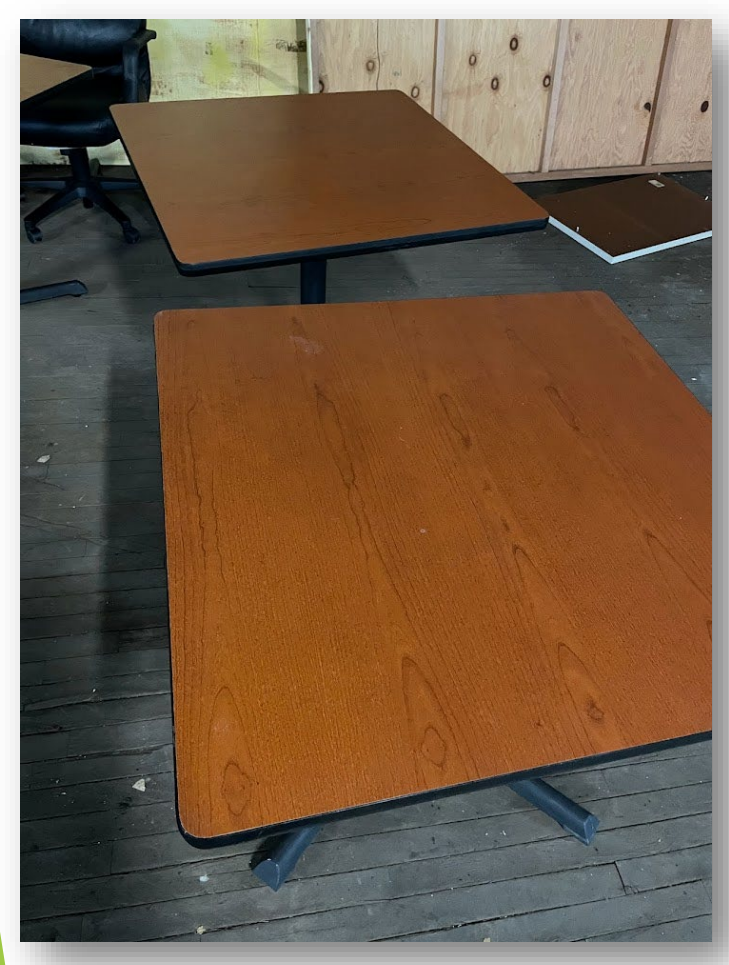
3' x 3' Like New Tables