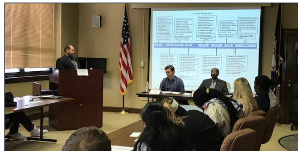
The National Bonner Leaders spoke to the Danville mayor and city councilmen during the spring retreat.